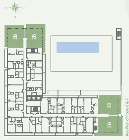
Key Plan of Floors 5 & 7.